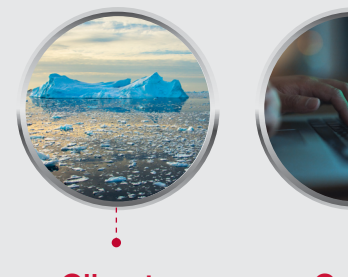
Climate Cyber Change Attacks